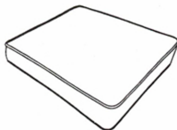
A: Seat cushion